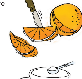
5 ml Sugar / 100 ml H20

Flowers : If you're unsure if your flowers are nectar-bearing, sprinkle some of the sugar-water nectar onto them daily using the pipette.